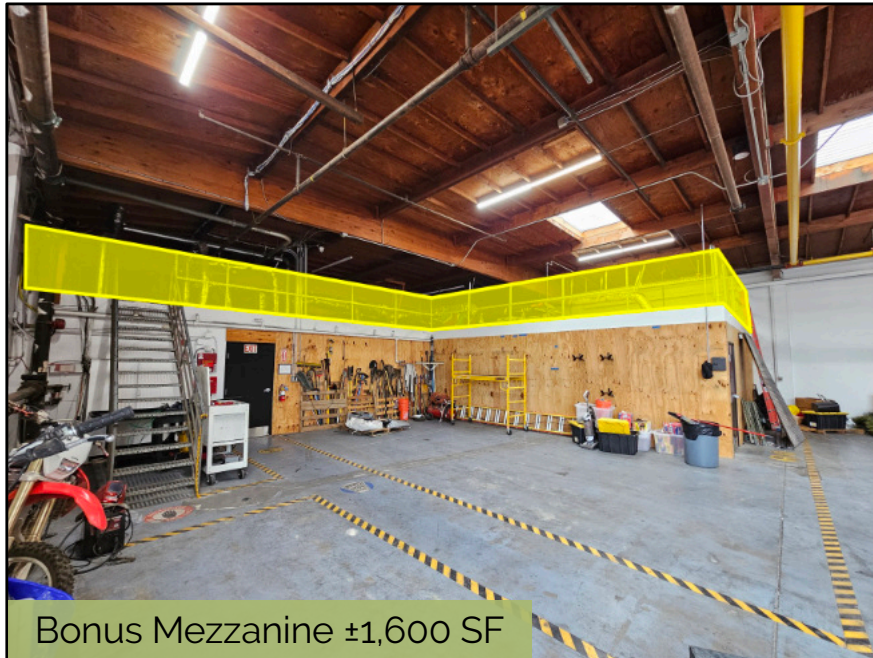
Bonus Mezzanine ±1,600 SF